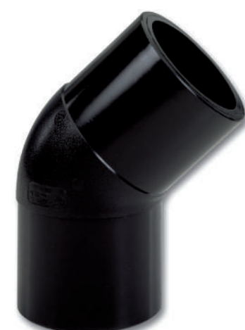
Code 3142 PN16 Code 3152 PN10