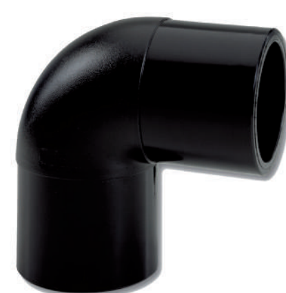
Code 3141 PN16 Code 3151 PN10