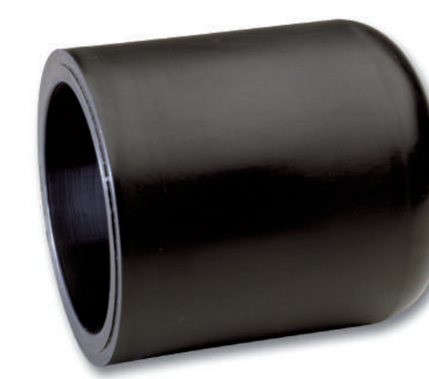
Code 3144 PN16 Code 3154 PN10