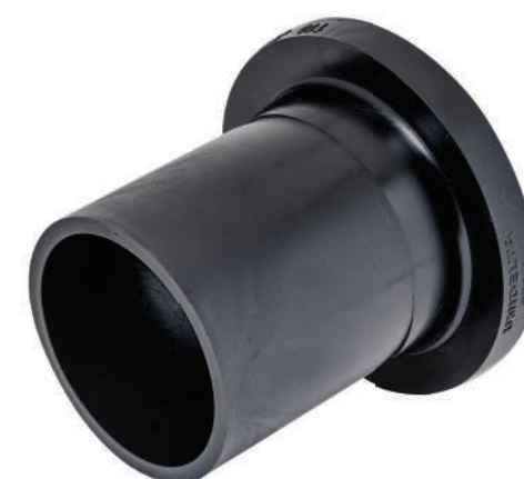
Code 3145-3148 PN16 Code 3155 PN10