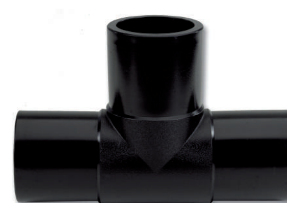
Code 3143 PN16 Code 3153 PN10