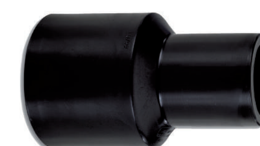
Code 3140 PN16 Code 3150 PN10