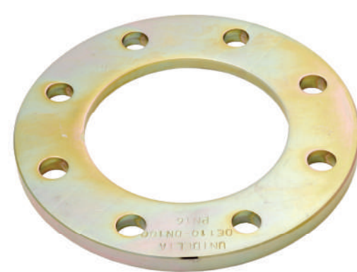
Code 3806 PN16 Code 3804 PN10