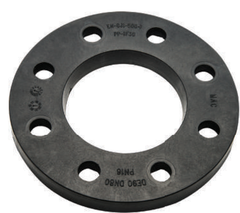
Code 3810 PN16 Code 3809 PN10